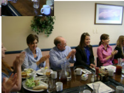
Volunteers attend Fellowship luncheon