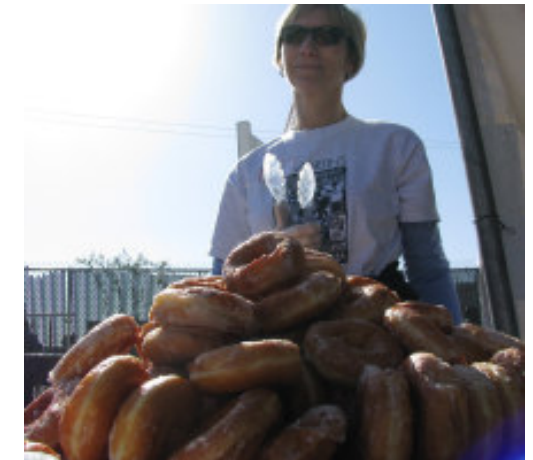
Connect to Care volunteer

NMCLA volunteers joined over 30 service organizations, including the Barrett Foundation, Dept of Workforce Solutions, Healthcare for the Homeless, Social Security Administration, the VA Medical Center, to provide information and referrals.