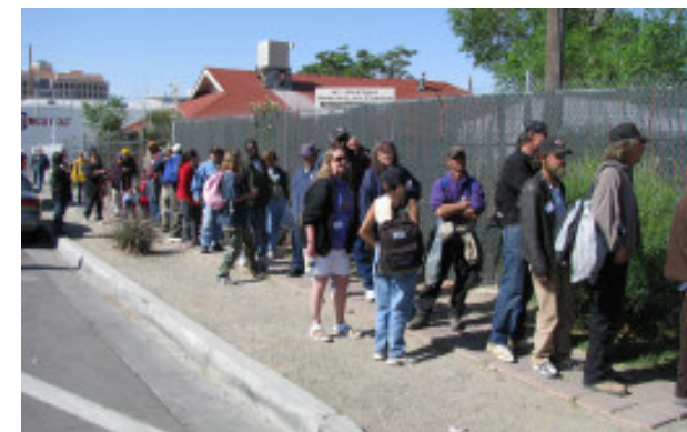
Persons served by Connect to Care

The event connected homeless persons with medical care, substance abuse treatment providers, and mental health counseling. The event also brought together several services critical to helping homeless citizens secure housing, employment assistance, social security, and legal assistance.