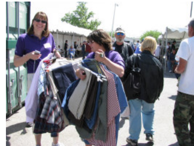
Connect to Care community providers

On May 3, 2008, New Mexico Christian Legal Aid joined community providers, the NM Coalition to End Homelessness, the Albuquerque Chamber of Commerce, Leadership Albuquerque, Comcast, and St. Martin's Hospitality Center, in an exciting Connect to Care event that served nearly 700 homeless and needy men, women and children.