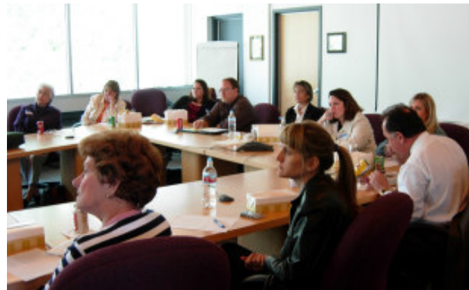
NMCLA Seminar attendees